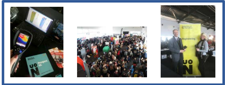
The Big Bang - Silverstone